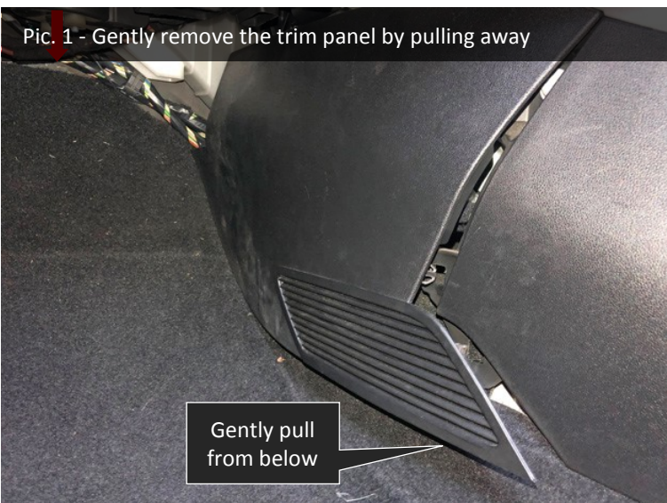
Pic. 1 - Gently remove the trim panel by pulling away