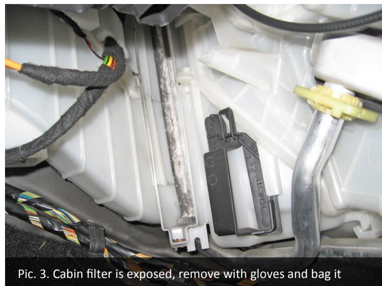
Pic. 3. Cabin filter is exposed, remove with gloves and bag it