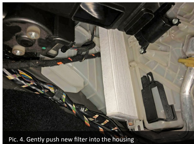
Pic. 4. Gently push new filter into the housing